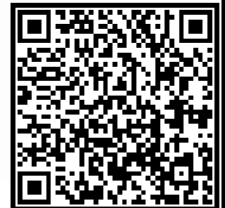
Holly Wise Chair

This WRAP certificate covers the facility with the address and production processes listed above. Please refer to the full audit report for details.